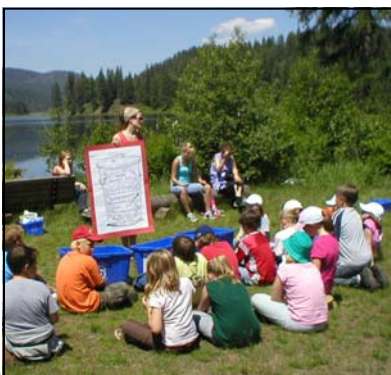
A recycling demo for kids age 7-10 at Camp Reed.

It has been a while since we've taken the time to describe the Living Green program. Some of you may not know we offer much more than just this newsletter.